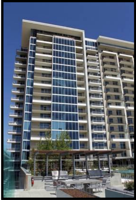
1400 Hi Line, a 24-story apartment tower, has a pool deck that covers three-quarters of an acre (foreground).