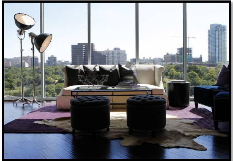
Work on the 24-story 1400 Hi Line tower, the largest apartment project in the Design District, started during the recession, and the project is opening as the economy revives. This two-bedroom unit has a view of downtown.