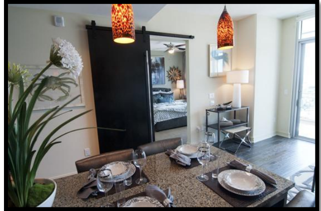
A model of one of the one-bedroom units at 1400 Hi Line.

1400 Hi Line recently signed Central Standard, a gastro sports pub concept, and is in lease negotiations with Sfuzzi for its latest location in the Design District. Next on the list: A small grocer, dry cleaners and postal service store.