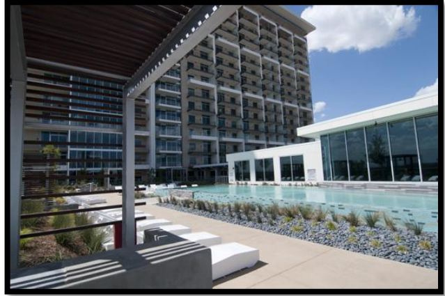
The salt water infinity-edge pool has an underwater soundsystem.

And if you want a view of luxe living — 1400 Hi Line has you covered. On the east side of the building, there's a grandiose view of the property's one-acre park, pool and amenity deck that overlooks the wave of interstate traffic.