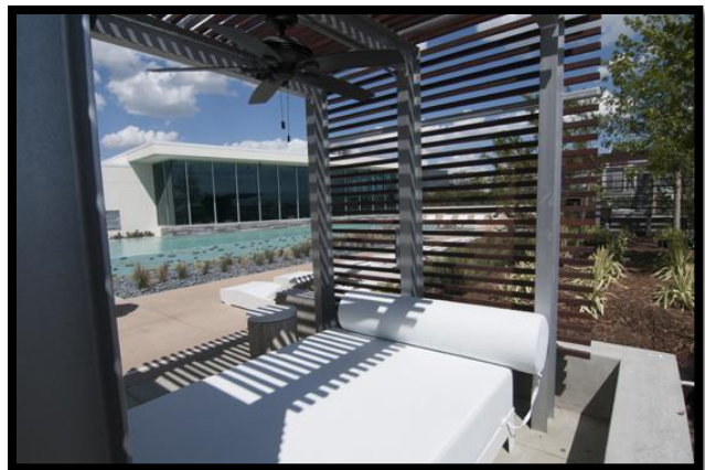
A poolside cabana at 1400 Hi Line.